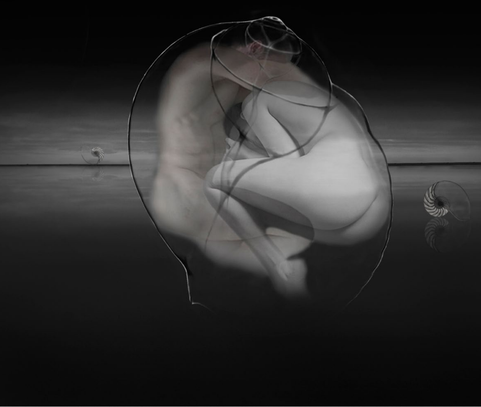
La naissance de l'amour 1

Beyond survival, happiness is the key driver of humanity.