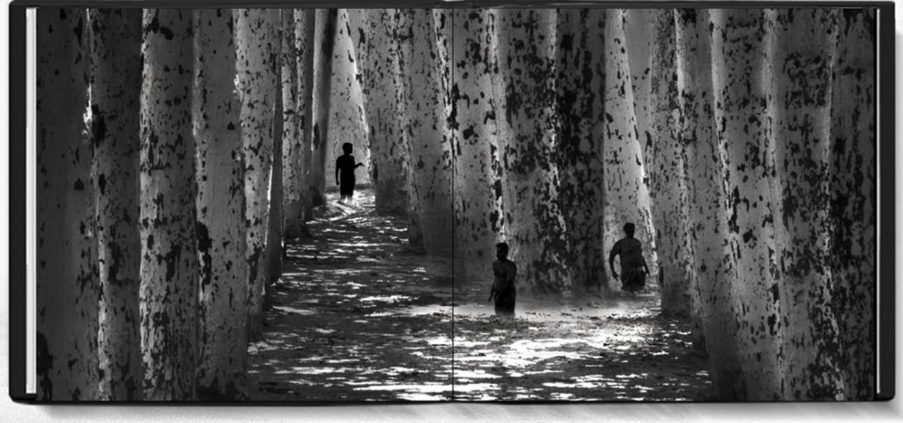
Book «les Éveillés» by Michel Kirch, texts by Christian Noorbergen

A book in a bilingual edition in the format 29 \times 29 \text{ cm}