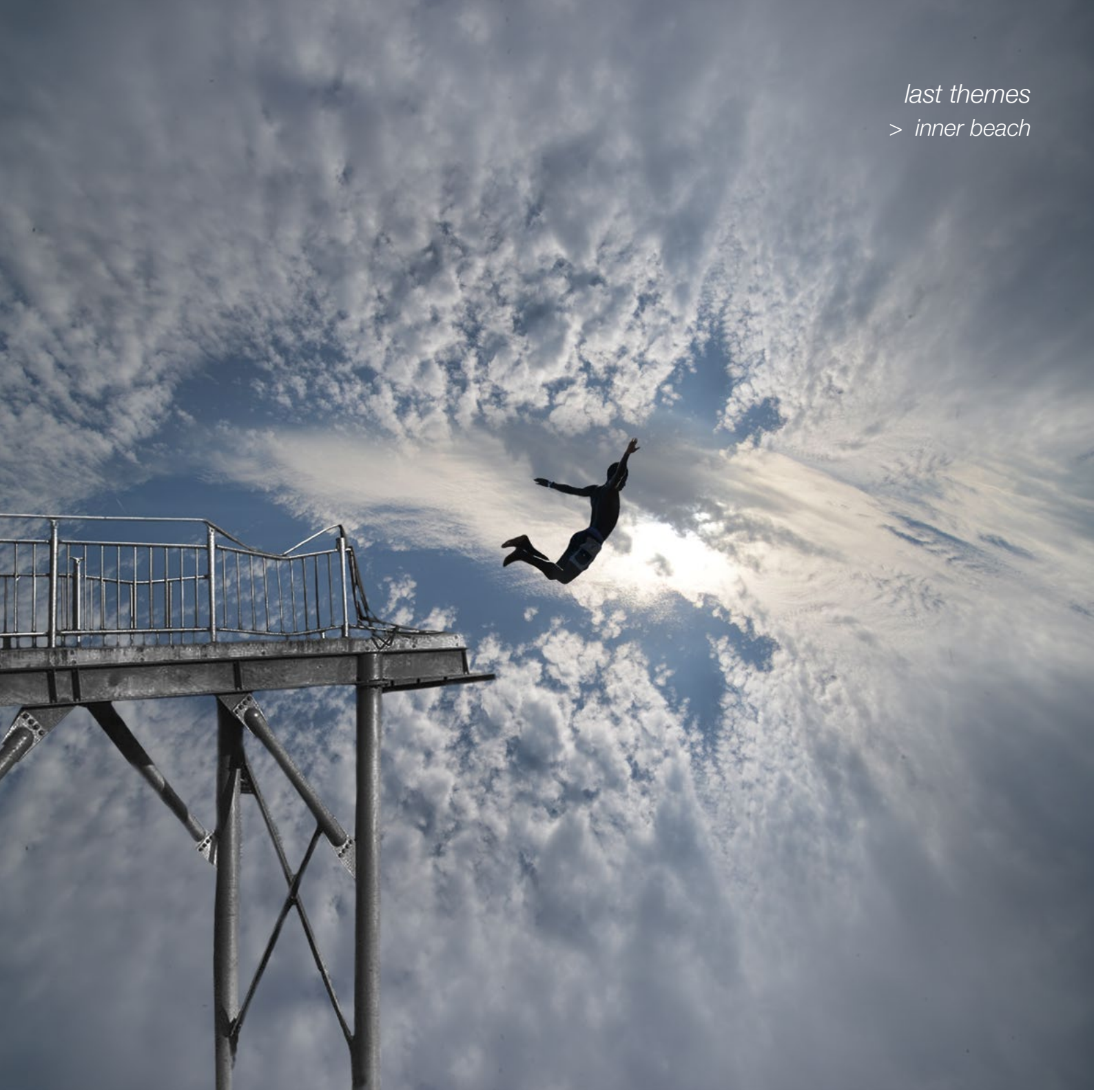
to the blue

The beach is a contemporary place. It differs from the port, the shore of a wild coast or estuary, by its ludic, human and sensual sides. The beach has grown along with urbanization, which it seems vital outlet. More the city becomes oppressive, stressed, laborious, swarming and concrete, and more the beach looks like an obliged shadow, a double saving. The one and the other are two sides of a world that becomes focused, uniformed, interconnected while emptying its traditional values.