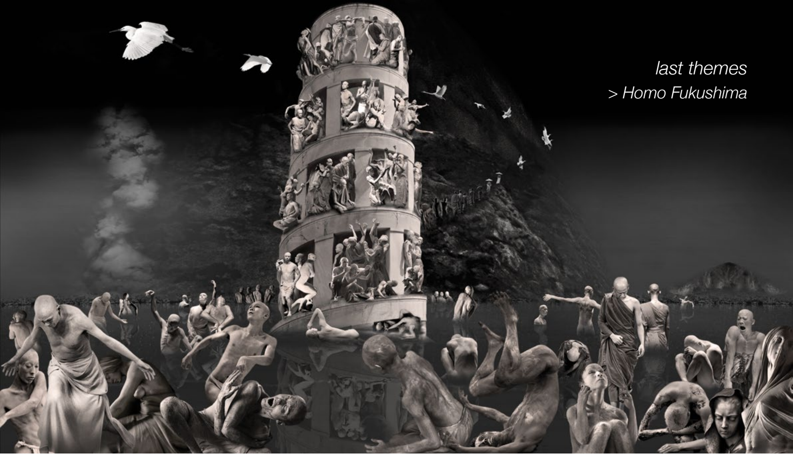
New Babel, triptyque de 154 x 240 cm Edition de 3