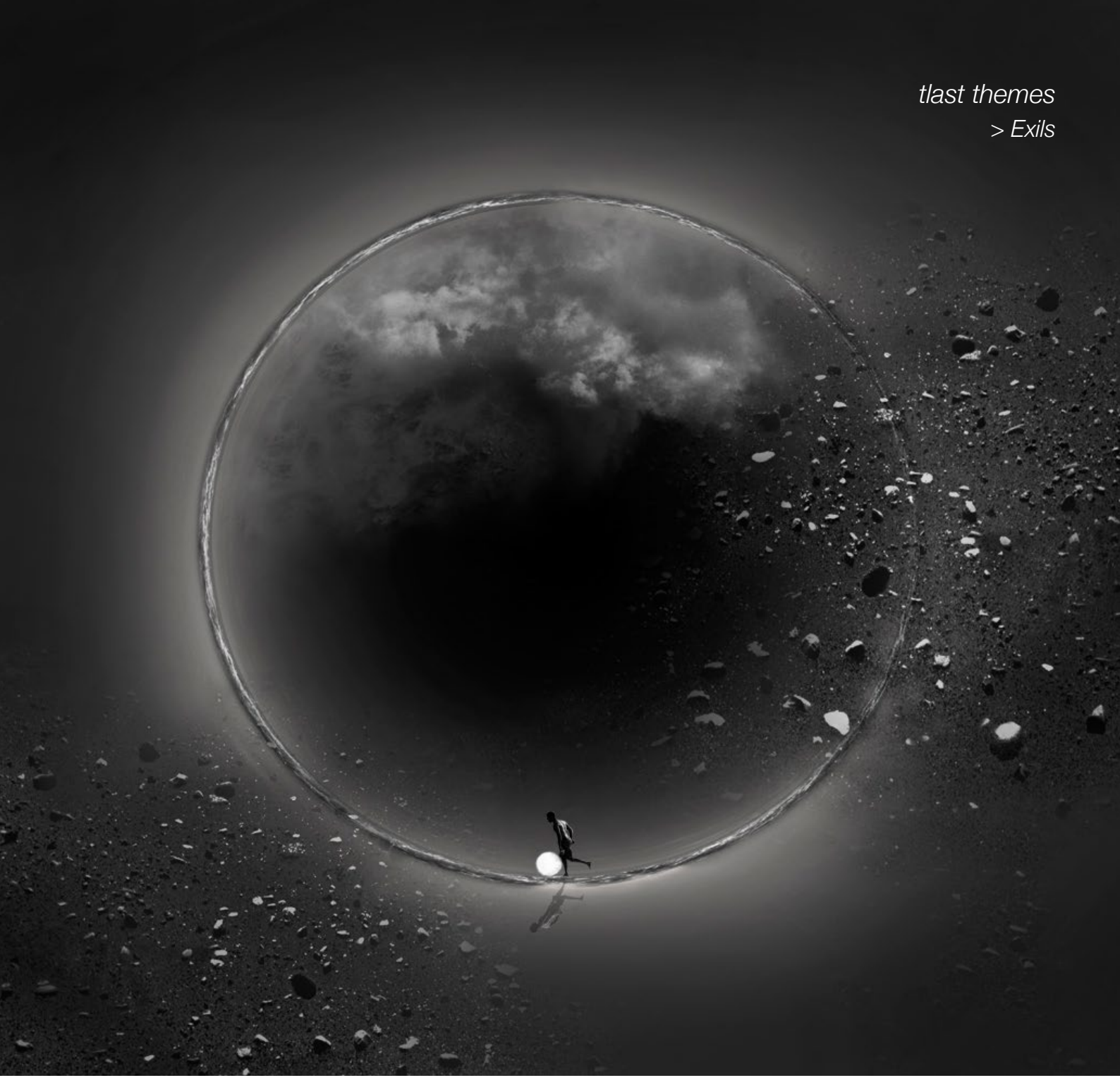
Life is a game

The sphere is the geometrical figure which constitutes the physical and aesthetic bond of this work.